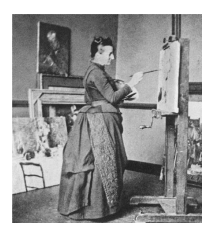
Anna Boch at Work