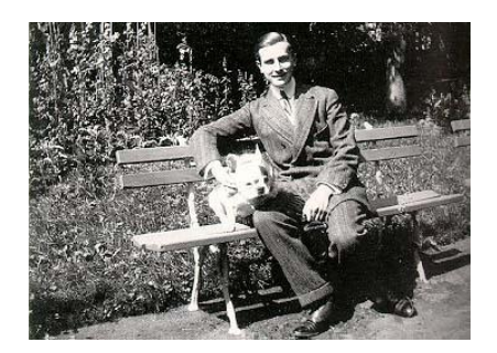
Prince Felix Yussupov