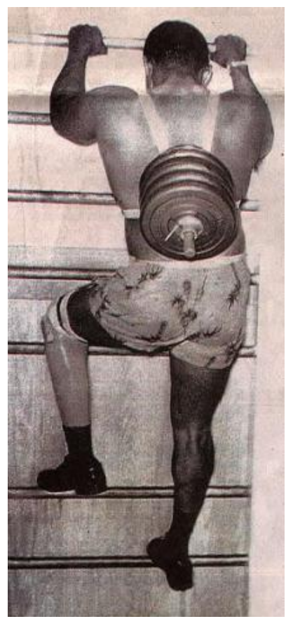
<u>Carl Brashear - Climbing with Weights</u> Photo of Carl Brashear, online courtesy U.S. Navy. View this asset at:

http://www.awesomestories.com/asset/view/Carl-Brashear-Climbing-with-Weights