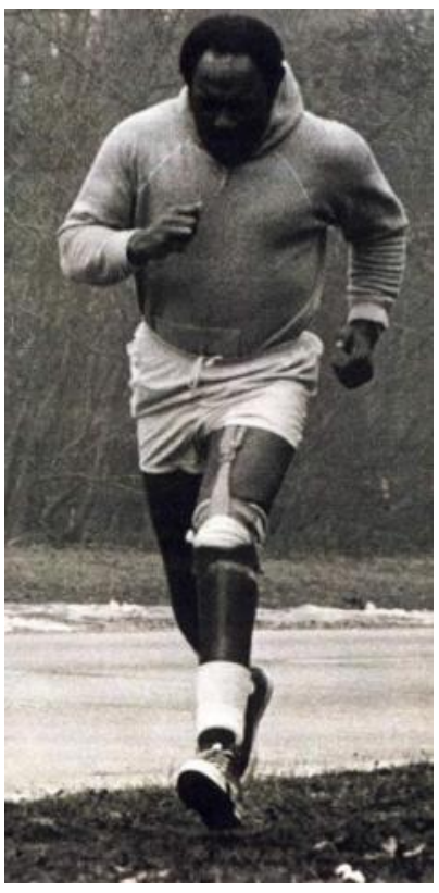
<u>Carl Brashear - Running with a Prosthesis</u>

http://www.awesomestories.com/asset/view/Carl-Brashear-After-His-Amputation