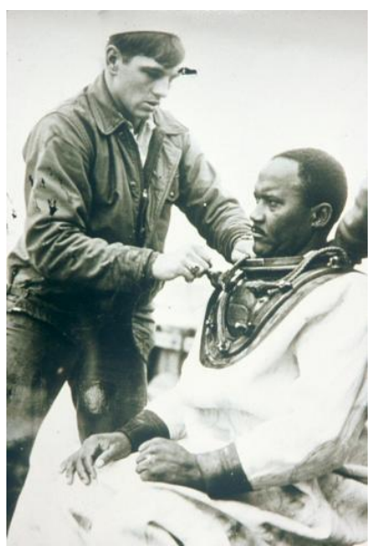
BREAKING THE RULES

http://www.awesomestories.com/asset/view/Carl-Brashear-Climbing-with-Weights