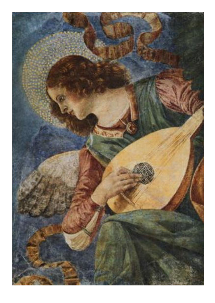
<u>Da Forli Painting - Angel with Lute</u>