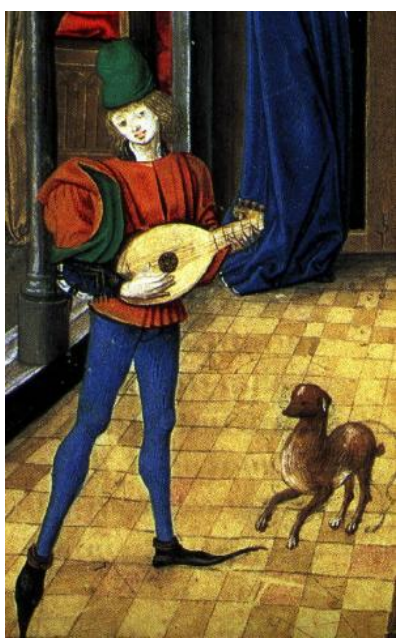
Image by Paul Slater. Copyright Paul Slater, all rights reserved. Image provided here as fair use for educational purposes. Online via the <a href="mailto:banjolin.co.uk">banjolin.co.uk</a> website. View this asset at: <a href="http://www.awesomestories.com/asset/view/Mandolin">http://www.awesomestories.com/asset/view/Mandolin</a>