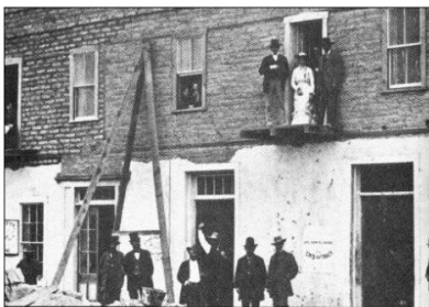
The Cosmopolitan Hotel in Tombstone

http://www.awesomestories.com/asset/view/Street-Map-of-Tombstone