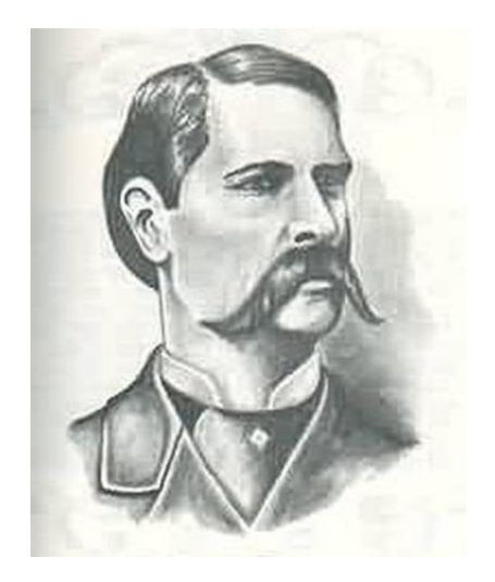
Illustration of Wyatt Earp

http://www.awesomestories.com/asset/view/Allen-Street-in-Tombstone