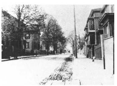
Image online, courtesy thelizziebordencollection.com View this asset at: <a href="http://www.awesomestories.com/asset/view/Emma-Borden">http://www.awesomestories.com/asset/view/Emma-Borden</a>