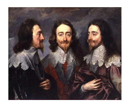
<u>Charles I - Beheaded King of Great Britain</u> Image online, courtesy Wikimedia Commons. View this asset at:

http://www.awesomestories.com/asset/view/Charles-I-Beheaded-King-of-Great-Britain