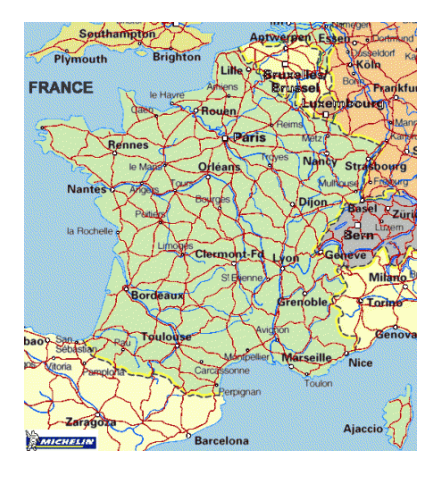
La Rochelle - Map Locator