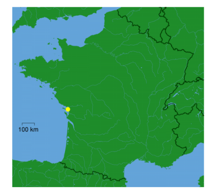
La Rochelle - Map

View this asset at: <a href="http://www.awesomestories.com/asset/view/La-Rochelle-Siege">http://www.awesomestories.com/asset/view/La-Rochelle-Siege</a>