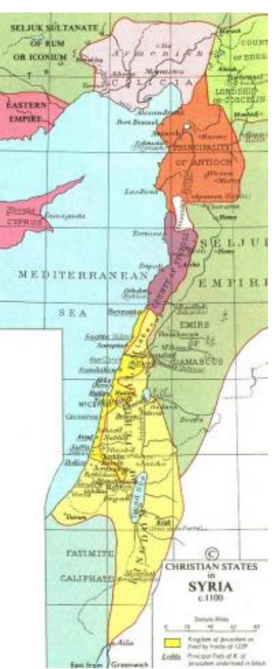
Image online, courtesy Wikimedia Commons. PD View this asset at: http://www.awesomestories.com/asset/view/lsabella

<u>Antioch - Map Locator</u> Image online, courtesy Wikimedia Commons.