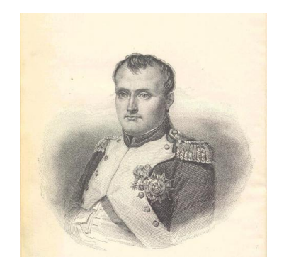
Napoleon: A Portrait