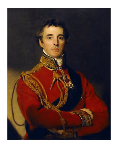
Arthur Wellesley - Portrait

http://www.awesomestories.com/asset/view/Joseph-Bonaparte-and-the-Case-of-the-Crown-Jewels