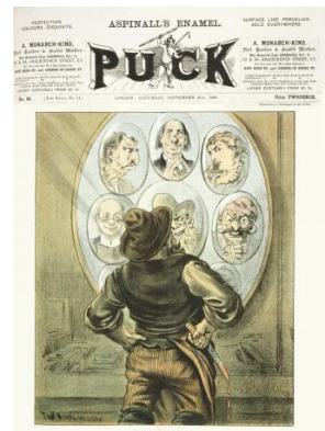
WHO IS HER WHAT IS HER WHO IS HER WHAT IS HER

• the diary might be authentic (not a hoax);