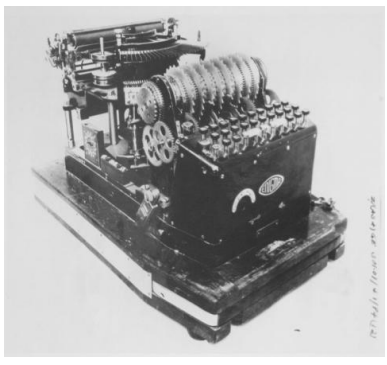
Enigma Machine Photo - View Inside

View this asset at: <a href="http://www.awesomestories.com/asset/view/Arthur-Scherbius">http://www.awesomestories.com/asset/view/Arthur-Scherbius</a>