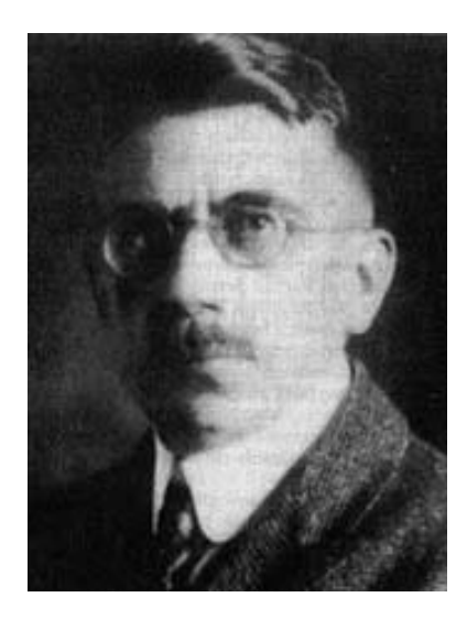
<u>Arthur Scherbius</u>

View this asset at: <a href="http://www.awesomestories.com/asset/view/Arthur-Scherbius">http://www.awesomestories.com/asset/view/Arthur-Scherbius</a>