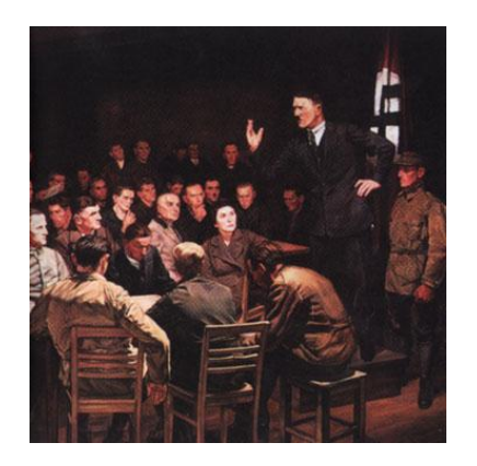
Hitler - National Socialist Party

http://www.awesomestories.com/asset/view/Enigma-Machine-Photo-View-Inside