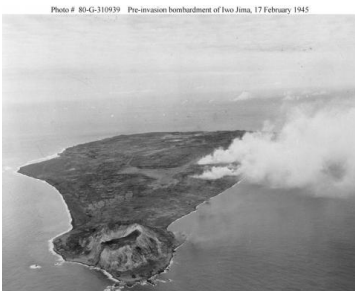
Photo # 80-G-310939 Pre-invasion bombardment of Iwo Jima, 17 February 1945

http://www.awesomestories.com/asset/view/Photograph-of-Iwo-Jima-Cemetery