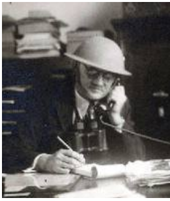
John Rabe at his desk in Nanjing.

His diaries, written at the time the atrocities occurred, provide primary evidence of what he saw and what was reported to him. Soon after Japanese troops captured Nanking - in December of 1937 - the killing and looting began: