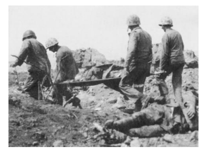
View this asset at: http://www.awesomestories.com/asset/view/Marines-Coming-Ashore-in-Iwo-Jima

JUST A MOP-UP? View this asset at: <u>http://www.awesomestories.com/asset/view/</u>