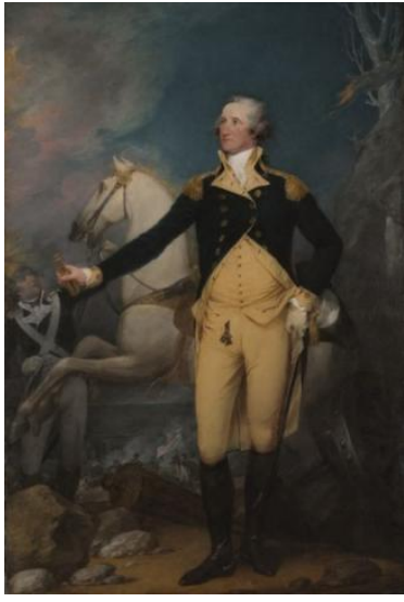
<u>American Revolution - Highlights</u>

View this asset at: <a href="http://www.awesomestories.com/asset/view/Thomas-Paine">http://www.awesomestories.com/asset/view/Thomas-Paine</a>