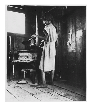
<u>Living on Very Little - Great Depression Photo</u> Image online, courtesy the U.S. National Archives. View this asset at: <a href="http://www.awesomestories.com/asset/view/Living-on-Very-Little-Great-Depression-Photo">http://www.awesomestories.com/asset/view/Living-on-Very-Little-Great-Depression-Photo</a>