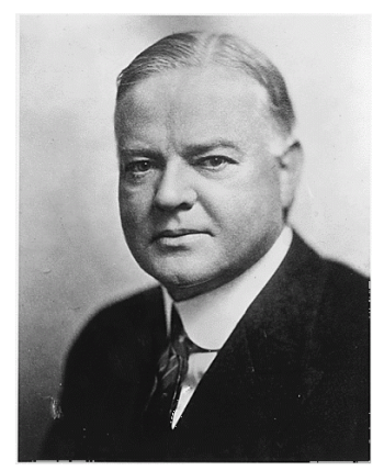
<u>President Herbert Hoover</u> Image online, courtesy the U.S. National Archive Photo, 40/19/40-1856a. View this asset at: <a href="http://www.awesomestories.com/asset/view/President-Herbert-Hoover">http://www.awesomestories.com/asset/view/President-Herbert-Hoover</a>