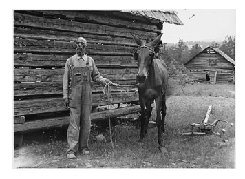
Image online, courtesy the U.S. National Archives. Photo 27/8/27-0764a. View this asset at: <a href="http://www.awesomestories.com/asset/view/Perry-Rupert">http://www.awesomestories.com/asset/view/Perry-Rupert</a>