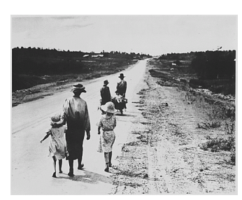
Image online, courtesy the U.S. National Archives. Photo 27/8/27-0763a View this asset at: <a href="http://www.awesomestories.com/asset/view/Alvin-Sharpe">http://www.awesomestories.com/asset/view/Alvin-Sharpe</a>