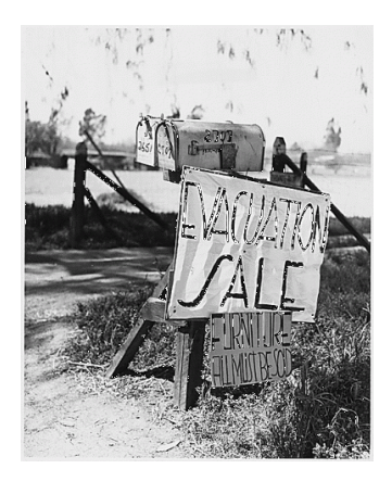
Forced to Evacuate - Photo