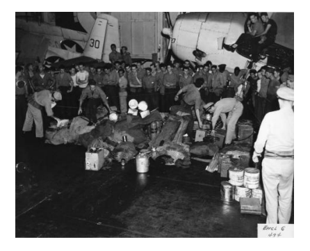
Image online, courtesy the <u>U-boat Archive</u> website. View this asset at: <u>http://www.awesomestories.com/asset/view/Boarding-Party-Working-on-U-505</u>

<u>Gear Recovered From U-505</u> Image online, courtesy the U-boat Archive website. View this asset at: http://www.awesomestories.com/asset/view/Gear-Recovered-From-U-505