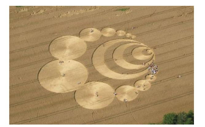
Photo of Crop Circle in Switzerland - in 2007 - by Jabberocky. Image online, courtesy Wikimedia Commons.

Nobody ever sees them formed. We usually come across them when we are working in the fields.