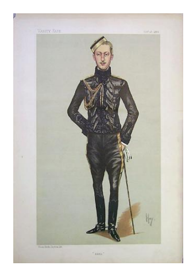
Prince Albert Victor