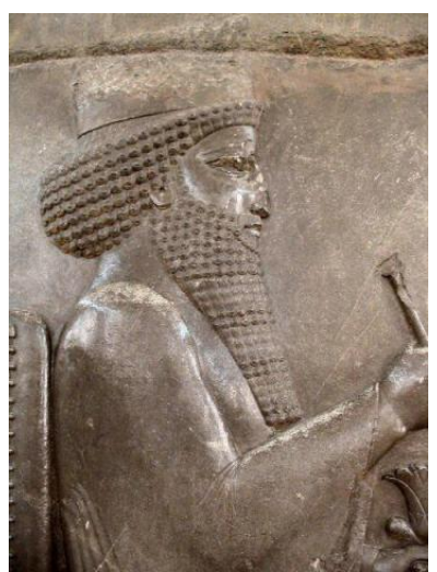
Darius I - King of the Persians

View this asset at: <a href="http://www.awesomestories.com/asset/view/Xerxes-On-the-Move">http://www.awesomestories.com/asset/view/Xerxes-On-the-Move</a>