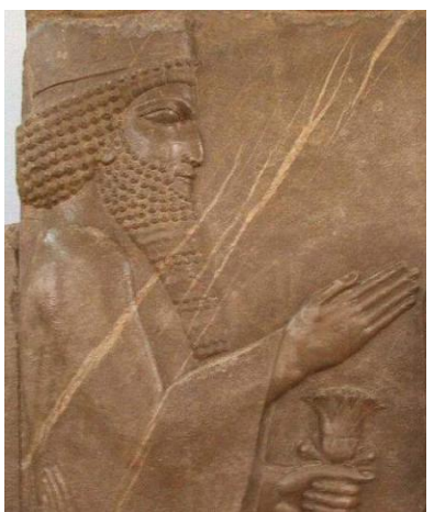
Xerxes I - King of the Persians

View this asset at: <a href="http://www.awesomestories.com/asset/view/Herodotus2">http://www.awesomestories.com/asset/view/Herodotus2</a>