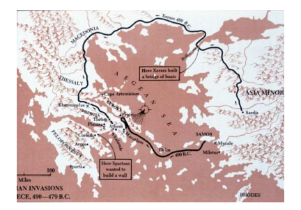
Xerxes On the Move

http://www.awesomestories.com/asset/view/Xerxes-I-King-of-the-Persians