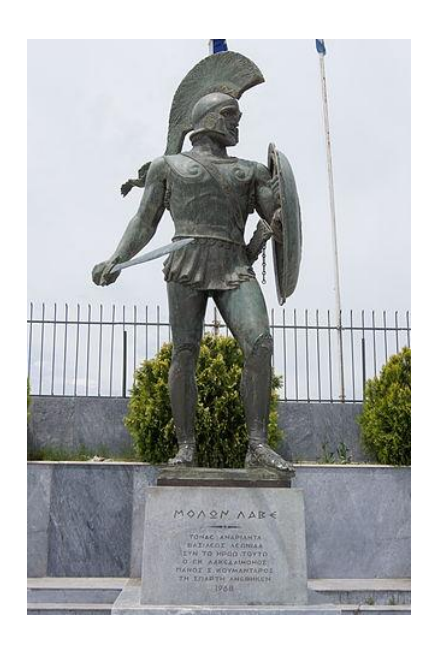
300 - Thermopylae and Rise of an Empire View this asset at:

\underline{\text{http://www.awesomestories.com/asset/view/300-Thermopylae-and-Rise-of-an-Empire0}}