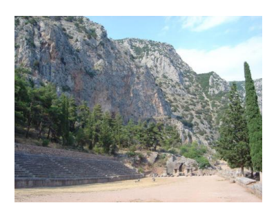
Delphi - Place to Consult the Oracle

Image online, courtesy Wikimedia Commons. License: CC BY-SA 1.0. View this asset at: