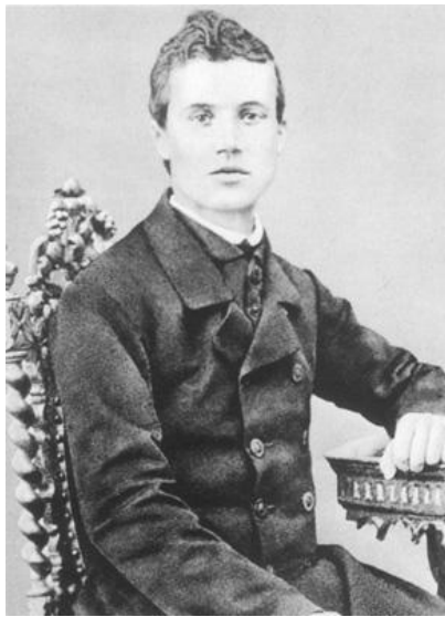
Pope Pius X as Giuseppe Sarto

View this asset at: http://www.awesomestories.com/asset/view/