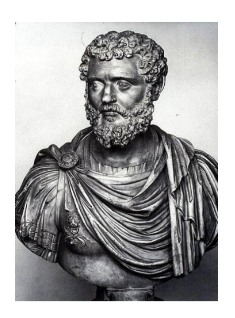
Emperor Didius Julianus Image online, courtesy <u>Find a Grave</u>. PD

http://www.awesomestories.com/asset/view/Bust-of-Emperor-Pertinax