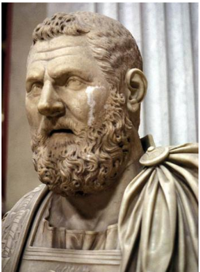
Bust of Emperor Pertinax

View this asset at: <a href="http://www.awesomestories.com/asset/view/Commodus-Bust">http://www.awesomestories.com/asset/view/Commodus-Bust</a>