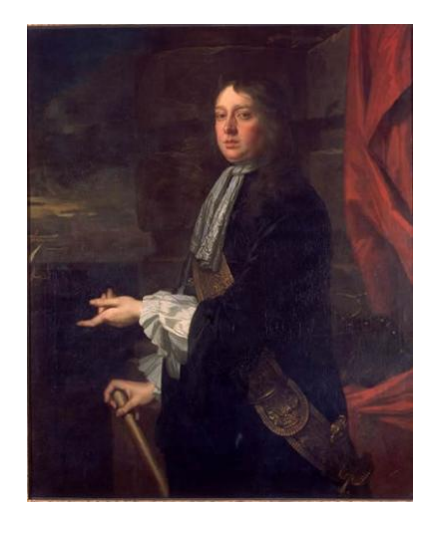
<u>Portrait of Admiral William Penn</u>