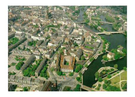
Photograph of Oder River