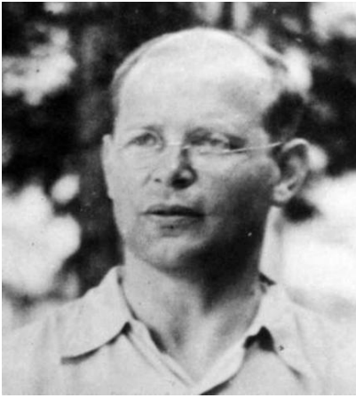
Photo of Dietrich Bonhoeffer

Image online, courtesy the Bonhoeffer-Haus website.