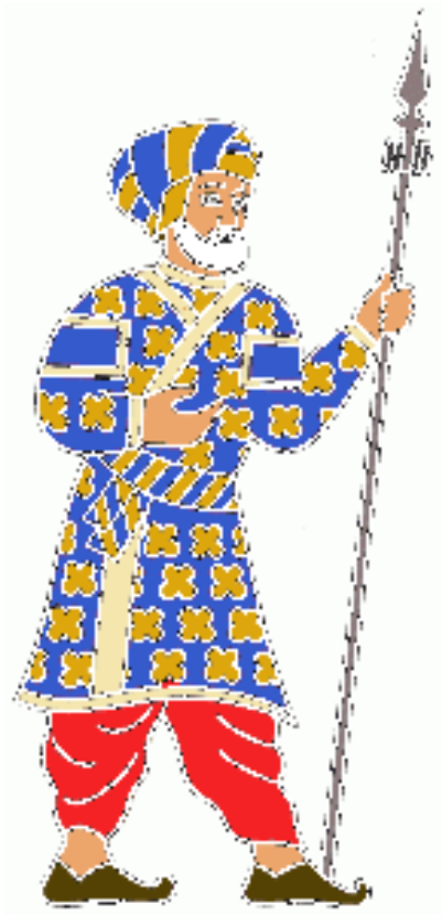
Illustration of Early Muslim Clothing