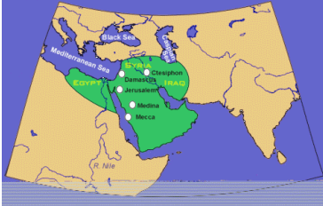
The Spread of Islam under Umar, 634-44

http://www.awesomestories.com/asset/view/Spread-of-Islam-Under-Abu-Bakr-632-634-C.E.