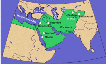
Muslim Expansion in Central Asia under the Umayyad Dynasty, 661-750 CE

http://www.awesomestories.com/asset/view/Muslim-Expansion-in-North-Africa-661-750-C.E.