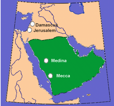
The Spread of Islam under Abu Bakr, 632-34 CE