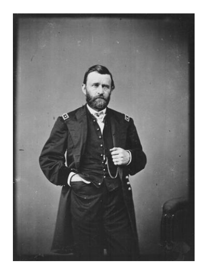
<u>Ulysses S. Grant</u>

View this asset at: <a href="http://www.awesomestories.com/asset/view/Ulysses-S.-Grant">http://www.awesomestories.com/asset/view/Ulysses-S.-Grant</a>