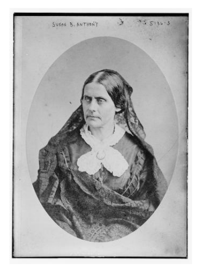
<u>Susan B. Anthony</u> Image online, courtesy the National Park Service. (NPS) View this asset at: <a href="http://www.awesomestories.com/asset/view/Susan-B.-Anthony">http://www.awesomestories.com/asset/view/Susan-B.-Anthony</a>

View this asset at: \underline{\text{http://www.awesomestories.com/asset/view/Horace-Greeley}}