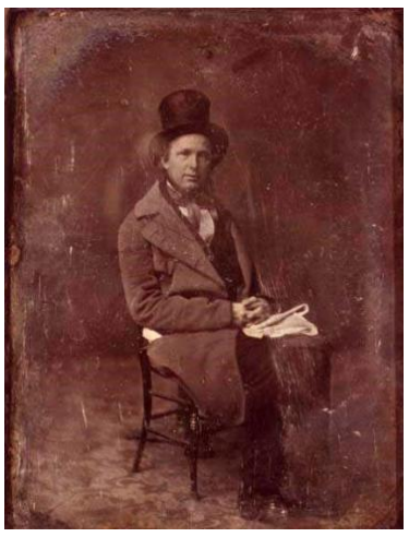
Horace Greeley Image online, courtesy the Library of Congress Website. PD

View this asset at: <a href="http://www.awesomestories.com/asset/view/Ulysses-S.-Grant">http://www.awesomestories.com/asset/view/Ulysses-S.-Grant</a>