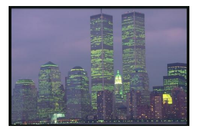
Image online, courtesy the BBC <u>website</u>. View this asset at: http://www.awesomestories.com/asset/view/Ramzi-Yousef-Foiled-Plot-Arrested-in-Manilla