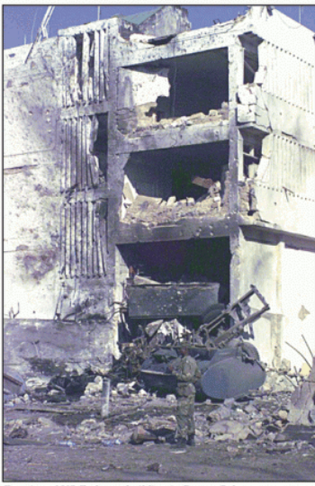
Exterior of US Embassy building in Dar es Salaam after bombing, 7 August.