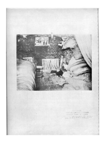
Stroop Photos - Hiding in a Dug-out

Image, courtesy Polish National Archives. PD