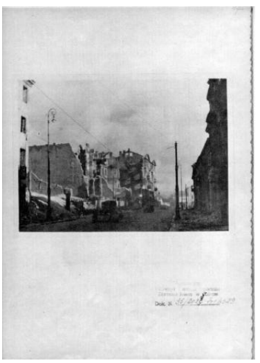
<u>Stroop Photos - Ghetto Destroyed</u> Image, courtesy Polish National Archives. PD

View this asset at: <a href="http://www.awesomestories.com/asset/view/Stroop-Photos-Ghetto-Burns">http://www.awesomestories.com/asset/view/Stroop-Photos-Ghetto-Burns</a>