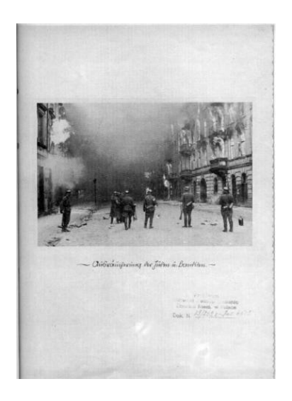
<u>Stroop Photos - Ghetto Burns</u> Image, courtesy Polish National Archives. PD

Information, United States Holocaust Memorial Museum.