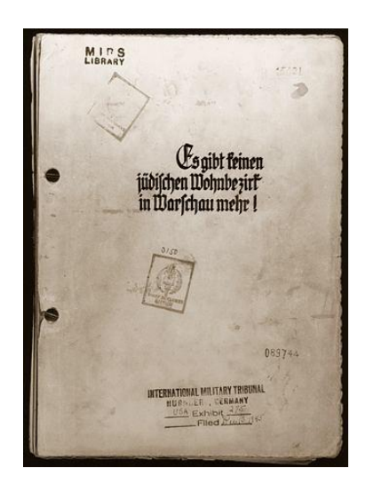
Album - Stroop Report