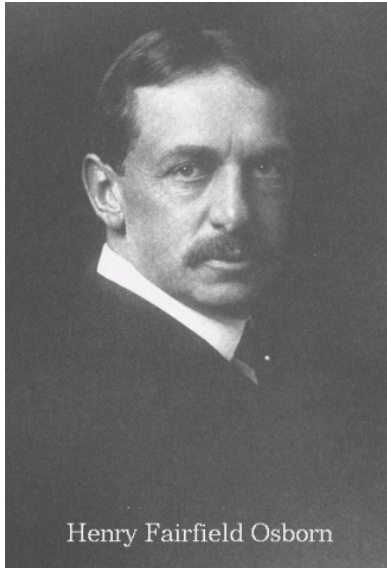
Henry Fairfield Osborn

http://www.awesomestories.com/asset/view/Montana-Location-of-Hell-Creek-Formation