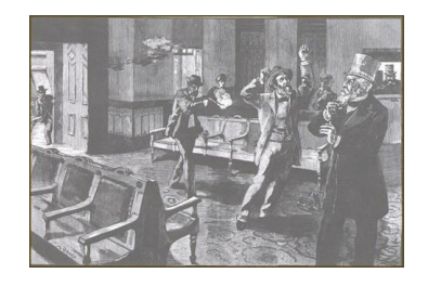
Illustration of the Shooting