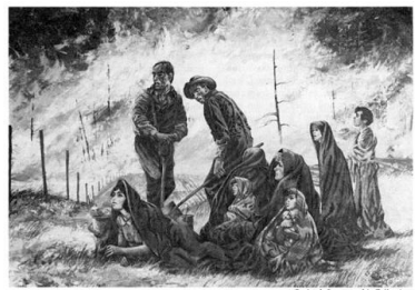
This painting by Mel Kiskadee graphically illustrates the plight of victims trapped in such outlying areas as the Sugar Bushes.

http://www.awesomestories.com/asset/view/Peshtigo-Fire-Area-of-Impact