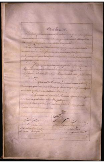
Napoleon's Response to Jefferson View this asset at:

http://www.awesomestories.com/asset/view/Napoleon-s-Response-to-Jefferson