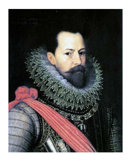
<u>Alexander Farnese - Duke of Parma</u> View this asset at:

http://www.awesomestories.com/asset/view/Alexander-Farnese-Duke-of-Parma