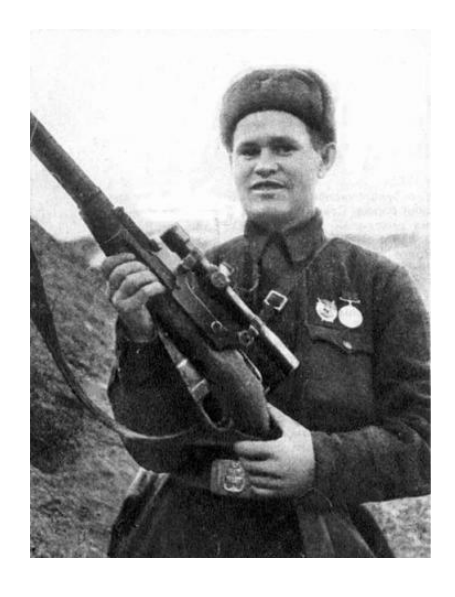
<u>Vasily Zaitsev Photo</u>