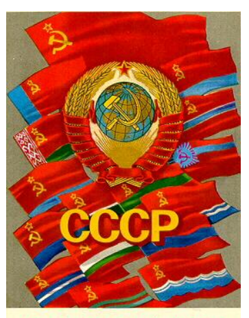
СЛАВА СОВЕТСКОЙ РОДИНЕ!