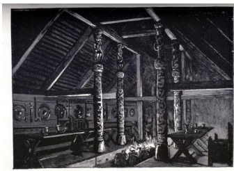
Illustration von der Halle Heorot (Helmungsdröhle). Die Abbildung zeigt die Innenseite der Halle (Ausschnitt), Nordseite (Ganzes Bild). Verlag von Carl Witten, Heidelberg.