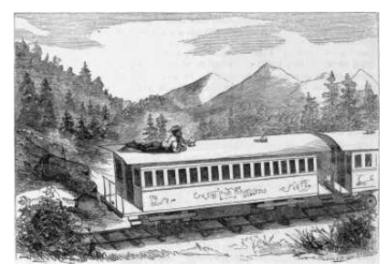
TRICKS AND DETERMINATION

View this asset at: <a href="http://www.awesomestories.com/asset/view/Walter-Rimm">http://www.awesomestories.com/asset/view/Walter-Rimm</a>