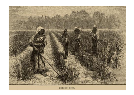
WHAT WAS IT LIKE?

View this asset at: <a href="http://www.awesomestories.com/asset/view/">http://www.awesomestories.com/asset/view/</a>