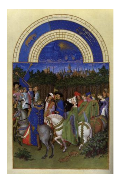
Celebrating the Month of May - Medieval Style