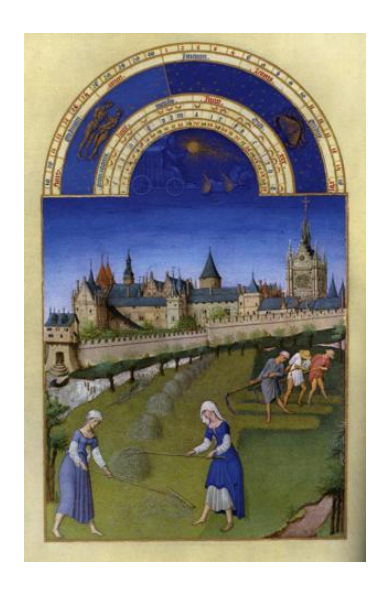
Medieval Harvest Scene