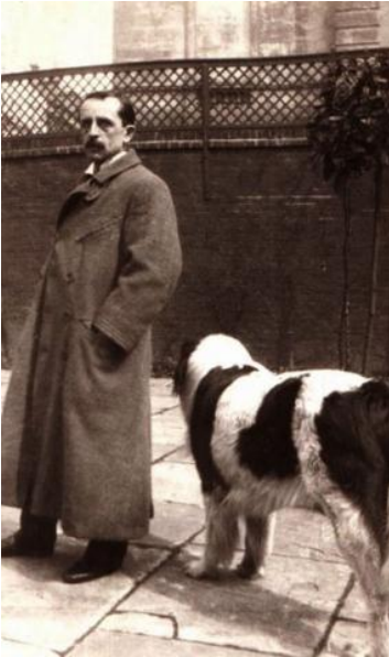
Photo of J.M. Barrie with his Dog, Luath

View this asset at: http://www.awesomestories.com/asset/view/Sylvia-Llewelyn-Davies0