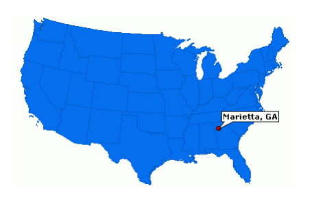
<u>Marietta, Georgia - Map Locator</u> Image online, courtesy <u>epodunk.com</u> website. View this asset at: <u>http://www.awesomestories.com/asset/view/Marietta-Georgia-Map-Locator</u>