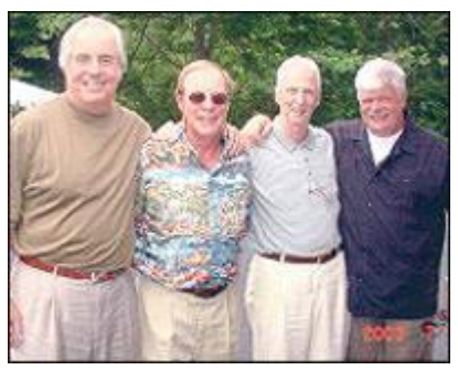
Abagnale with FBI Agents Image online, courtesy trutv.com website. View this asset at: http://www.awesomestories.com/asset/view/Abagnale-with-FBI-Agents