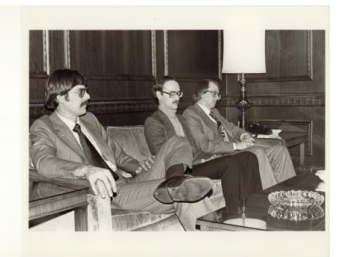
Image online. View this asset at: http://www.awesomestories.com/asset/view/ARGO-Lee-Schatz