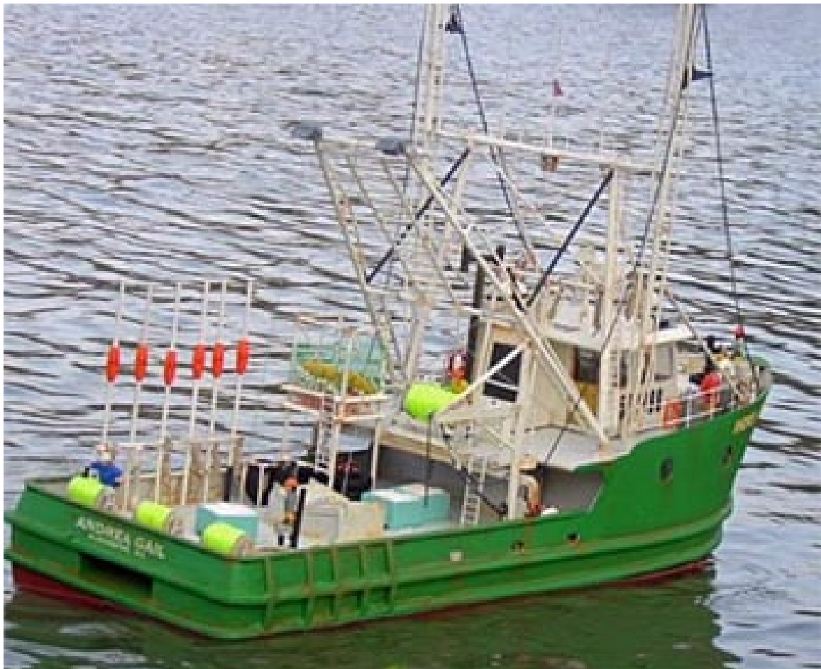
Andrea Gail, the ship which was lost during 1991's "Perfect Storm."