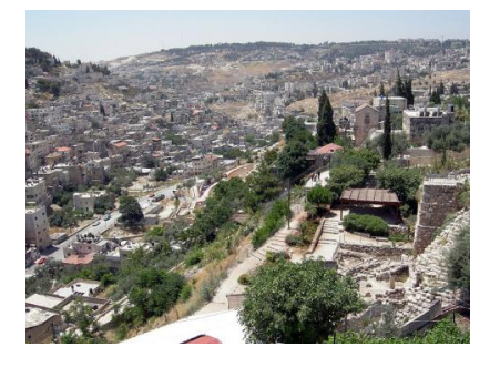
Kidron Valley - Panoramic View