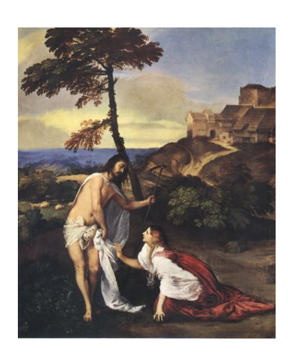
Mary Reached Out to Jesus - "Noli me Tangere" Image, described above,