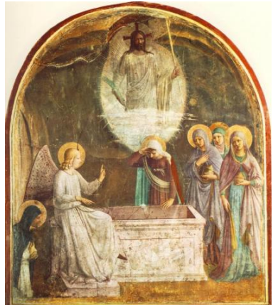
Women at the Tomb of Jesus Image, described above, online courtesy Web Gallery of Art. PD View this asset at:

http://www.awesomestories.com/asset/view/The-Resurrection-of-Christ-Albrecht-Altdorfer