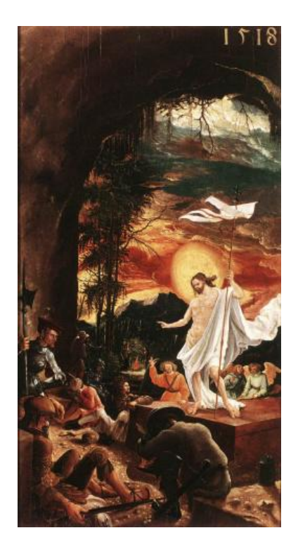
<u>The Resurrection of Christ - Albrecht Altdorfer</u>