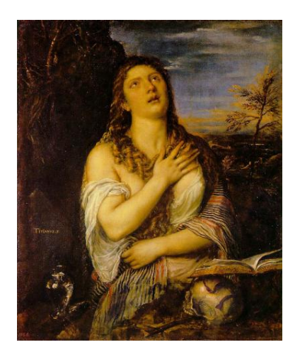
<u>Mary Magdalene - Titian</u> Image, described above, online courtesy Web Gallery of Art. PD

http://www.awesomestories.com/asset/view/Women-at-the-Tomb-of-Jesus0